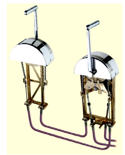
Diagram showing cable connection between stations.

NOTE: Two cables per engine are required for interconnecting the master (model 2091) and remote control (model 2093). These are 47 series pull-pull cables and are available in even foot lengths.