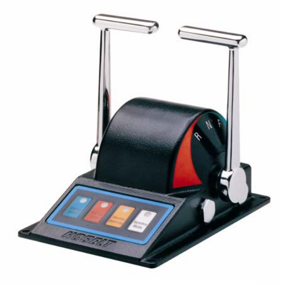
Standard two-engine control head in black finish