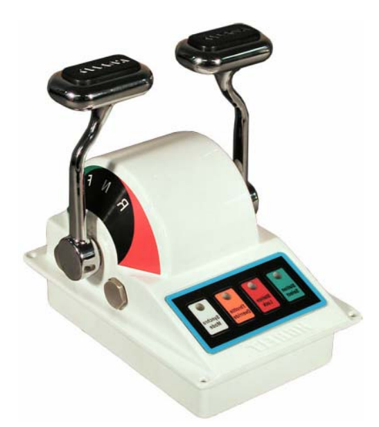
Control head with "E" style handles and white finish